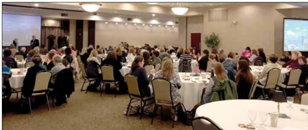
Healthcare professionals gather to learn about the latest information concerning immunizations.

Meningococcus B immunization is recommended for those aged 10 to 25 years, and the majority of the ACIP committee agreed that ages 16 to 18 is the preferred age range so that the protection will last into the highest risk period.