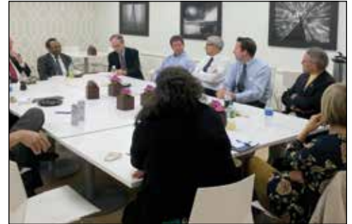
The physicians and interns gather at the Debrief Dinner to discuss their experiences with the program.

If you are an AMCNO member and would be interested in taking part in the 2017 Mini-Internship Program, contact the AMCNO offices at (216) 520-1000. To learn more about the program, visit our website at www.amcno.org . ■