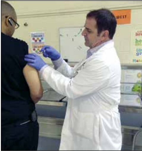
A registered voter receives a flu shot at a Vote & Vaccinate location on Election Day.

The Academy of Medicine of Cleveland & Northern Ohio (AMCNO) hosted its 15th annual "Vote and Vaccinate" program on Election Day, Nov. 8, 2016.