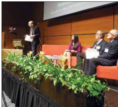
Following the opening presentation, panelists talk about the facts behind mental illness and violence.

The panel agreed that we are moving in the right direction to help decrease violence but it can be a challenge to sustain those efforts. They offered several suggestions. Services have to be based in communities where people live—they have to own it. Having young people involved should also be part of the process. Establish programs that can talk to each