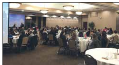
Healthcare professionals gather to learn about the latest information concerning immunizations.

He also discussed the safety considerations for the development of vaccines with novel adjuvants, assessing the risks versus benefits through each stage. He referred to the current climate for vaccinations as the "Golden Age," because new adjuvants have been and are being discovered—something that hasn't been done in the last 75 years.