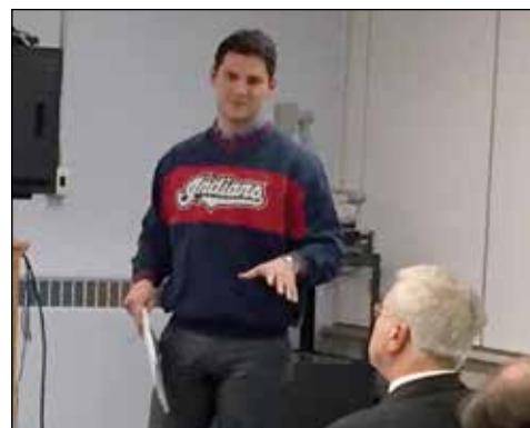
A financial planner from a local accounting firm discusses business and tax aspects of a medical practice.

The presenters provided positive feedback about the seminar as well, saying that they thought things went well, the event was well-attended and participants asked great questions. Only a few noted that they would have liked more time. All of the presenters said that they would be happy