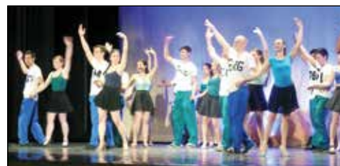
Medical students perform a spirited skit during the Doc Opera event.