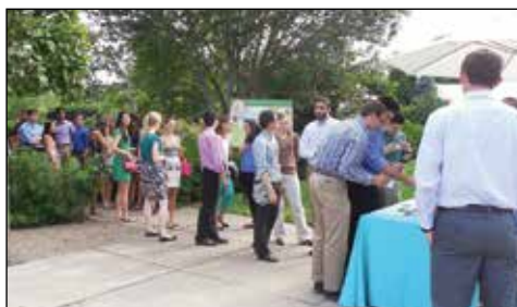
Medical students check in to the event and register to become AMCNO members.