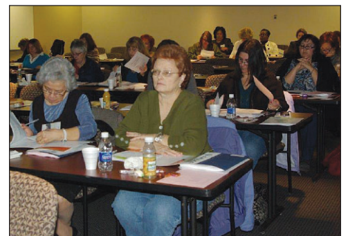
Practice administrators from around the region received valuable information from the insurance company representatives presenting at the session.