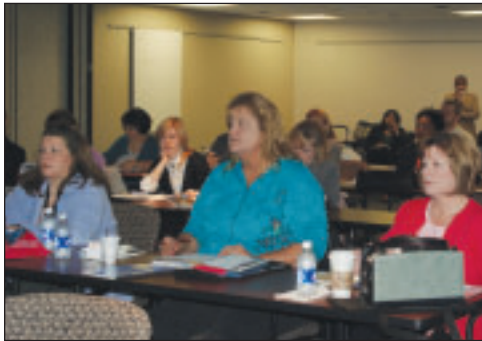
Practice managers from around the Northern Ohio region participated in the UnitedHealthcare Town Hall meeting at the AMCNO offices.

On May 18th, the AMCNO welcomed an audience of physicians and office managers to the UnitedHealthcare's Cleveland Town Hall Meeting. Various speakers discussed UnitedHealthcare's (UHC) newest programs and recent changes developed to help physician practices achieve greater efficiency and patient satisfaction.