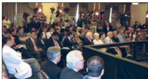
AMCNO physician members were in attendance as part of the capacity crowd listening to the comments from the President.

The President stated that there must be more transparency in medicine — if you can find