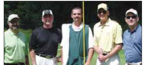
Event sponsor Medical Mutual foursome pose on the green.