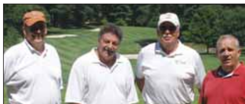
Third place winners – Event Sponsor foursome representing Walter and Haverfield.