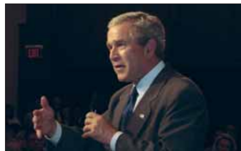
President Bush makes a point regarding electronic health records during his stop in Cleveland.

out the fee you will have to pay to have other services rendered a consumer should be able to obtain the cost for a service in medicine. The President noted that as an alternative to the federalization of health care there has to be alternatives and incentives built into the system such as health savings accounts and other methodologies that will allow the consumer to make health care spending choices — but in order to have these choices the consumer will need to be able to access cost information.