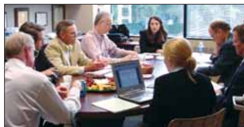
AMCNO physician representatives discuss key issues with MEDPAC and Mathematica staff.