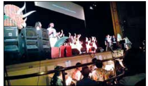
Medical student performers take the stage during the event.

Your patients are unique. Why isn't their medication?